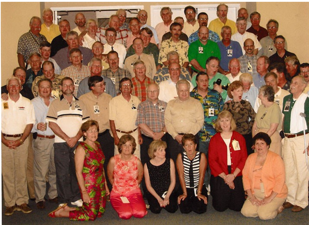
The Carolina Military Academy Alumni Association 1st Reunion 2003, Litchfield Beach SC

We ended up with about 95 or so CMA boys & girls & teachers! Our first reunion was HUGE. Each one since has been smaller. While I don't think that we will ever get back to the big numbers of our first & second reunions...I would like to see us begin to grow our attendance by using class agents. These cadets would reach out to their particular classes & encourage them to "come home".